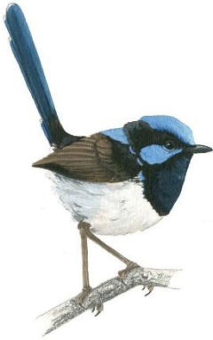
Fairy wren male ( https://fairywrenproject.org/meet-the-fairywrens/ )