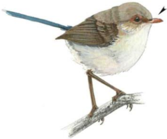
Fairy wren female ( https://fairywrenproject.org/meet-the-fairywrens/ )