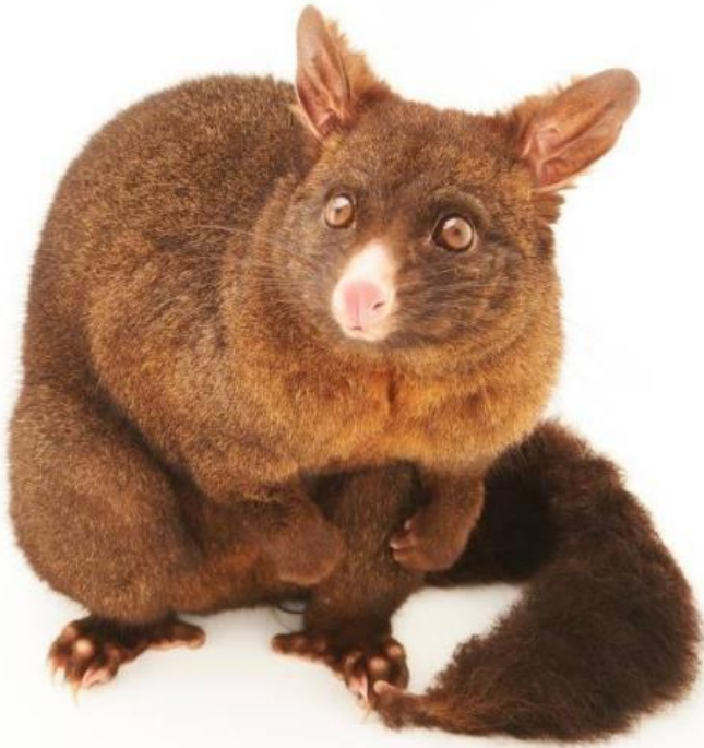
Common Brush tailed Possum